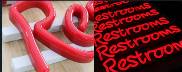
✓ Pre-installed onto a frame