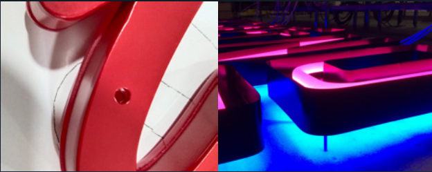
✓ Threaded rod fixing