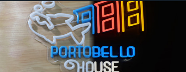
✓ Acrylic back panel with chased cabling