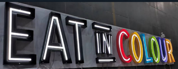
✓ Open channel letters